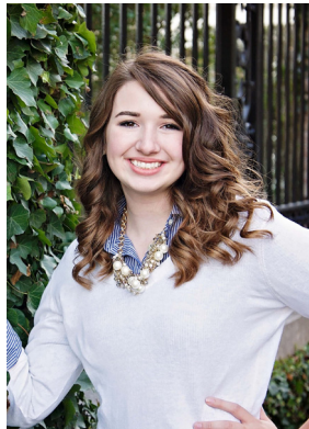
Katie Kjendal McCook High School